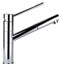
Mixer Tap Lorenzo 8466 000