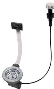
Automatic waste fitting 8407 000