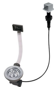
LIRA automatic waste fitting 8407 103