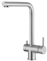
Miscelatore Gamma 3 vie - satinato 8496 100